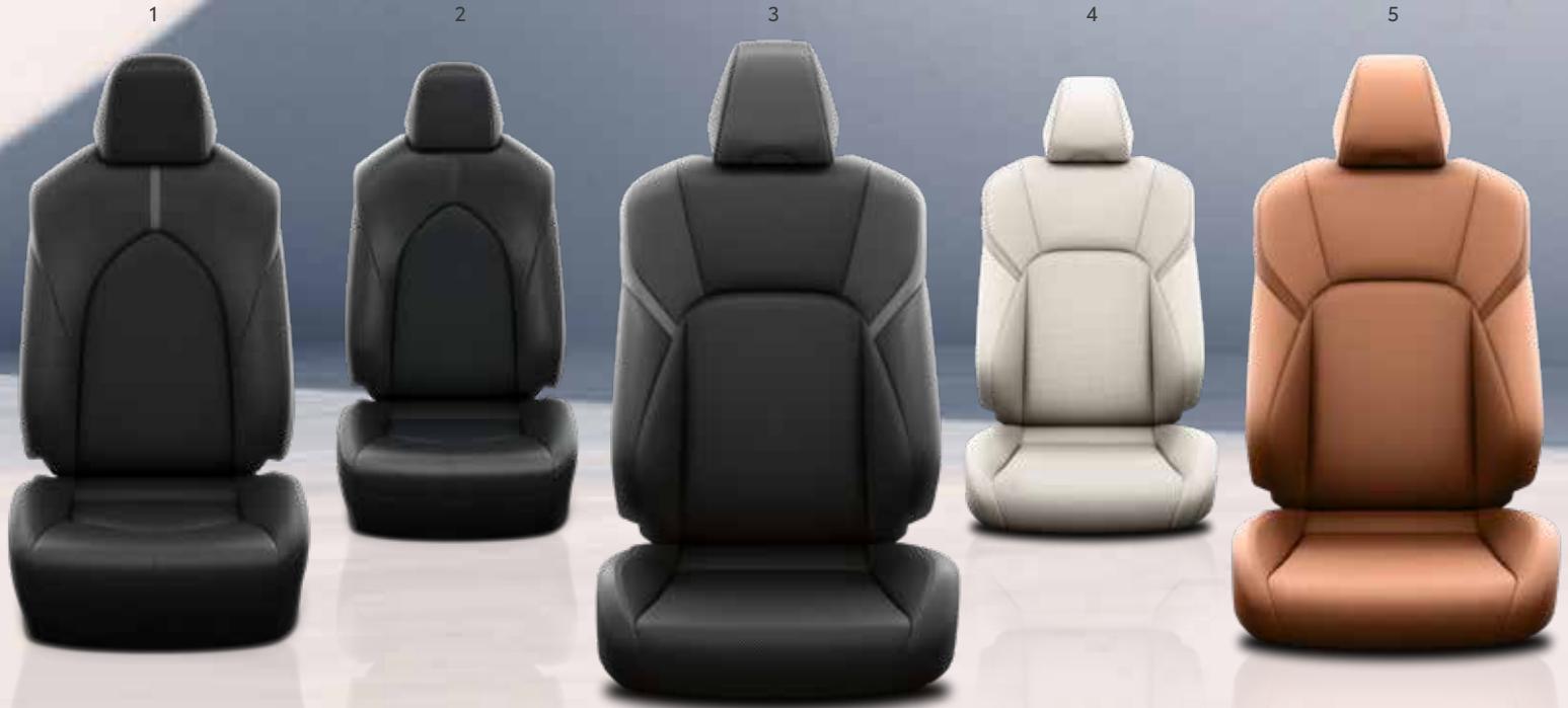
1. Black fabric Standard on Luxury 2. Black synthetic leather Standard on Luxury Business