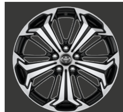
19" black machined-face alloy wheels (5-spoke) Standard on Premium