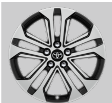
18" machined-face alloy wheels (5-double-spoke) Optional on all grades