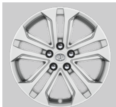
18" silver machined-face alloy wheels (5-double-spoke) Optional on all grades