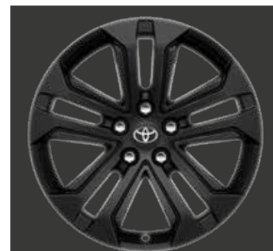
18" matt black machined-face alloy wheels (5-double-spoke) Optional on all grades