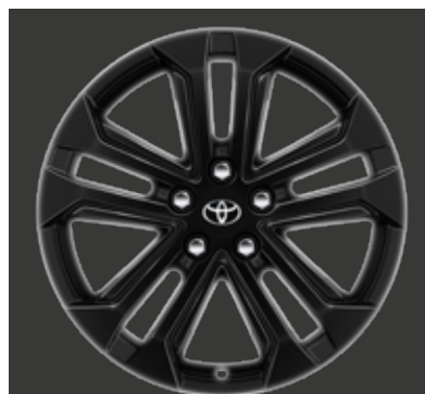
18" glossy black machined-face alloy wheels (5-double-spoke) Optional on all grades