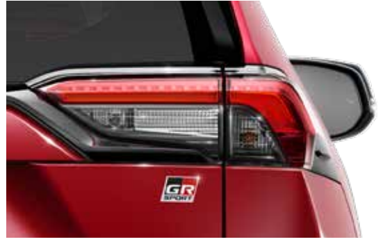
Dynamic shape Proudly display your GR SPORT credentials with its unique rear badge.