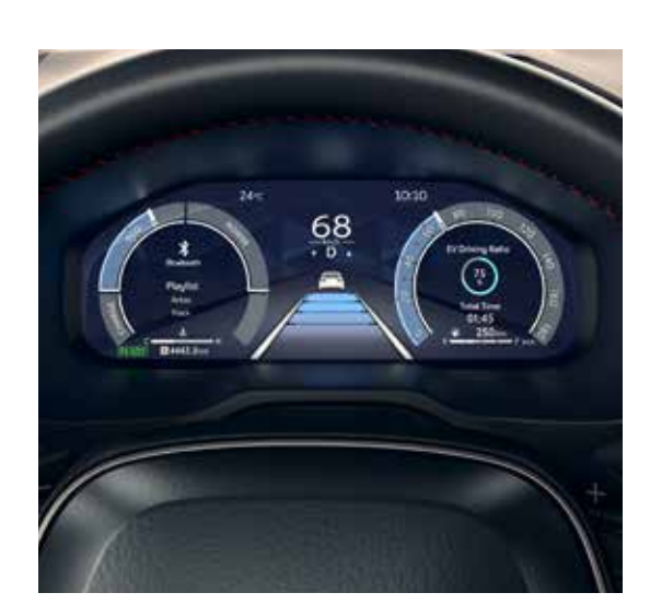
12.3" TFT combimeter A new 12.3" TFT combimeter keeps important information in your eye line while driving.