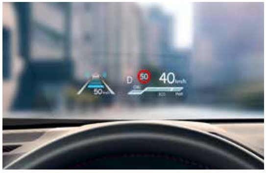
Head Up Display Keep up to date on your efficiency and other essential information, without taking your eyes off the road.